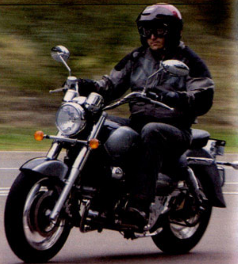
TEST BY CHRIS PICKETT