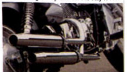
Pipes are stylish and sound good.