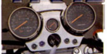
Gauges are prominent and easy to read.

WESTERN QBE CALL FOR A QUOTE TODAY FREE CALL 1 800 24 34 64 Your Motorcycle Insurance Specialists